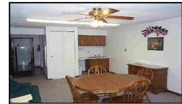
Interior - Community Room

The Community room is available to tenants anytime.